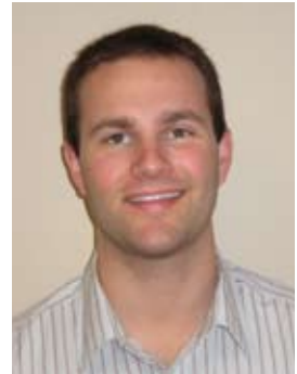
By Bill Yackey, editor, Digital Signage Today

Mobile phone outlets have been a sector of the retail market that has benefited greatly from digital signage.