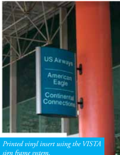
Printed vinyl insert using the VISTA sign frame system.