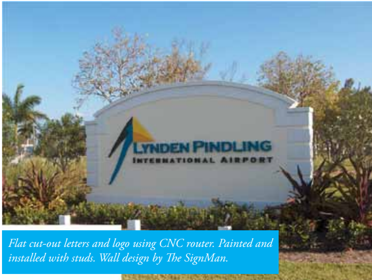
Flat cut-out letters and logo using CNC router. Painted and installed with studs. Wall design by The SignMan.

Perhaps of greatest importance is not what they design, manufacture and install, but how they do it, that is, how they construct 'solutions' for their clients' imaging problems.