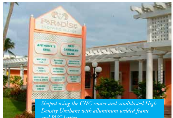
Shaped using the CNC router and sandblasted High Density Urethane with aluminum welded frame and PVC lattice.

"They have consistently provided good technical assistance and advice," he said. "The group is always open and willing to satisfy their clients. They are prepared to ask the kinds of questions that provoke answers necessary to deliver solutions."