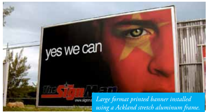
Large format printed banner installed using a Ackland stretch aluminum frame.

It has been almost 20 years since it opened and much has changed for the SignMan – its product line, capabilities and