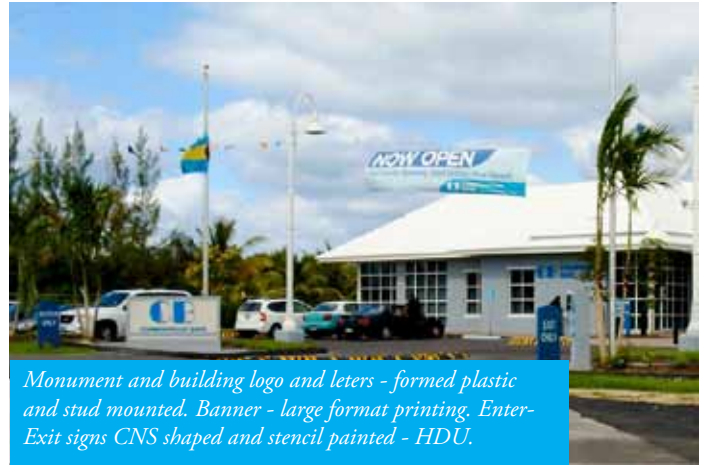
Monument and building logo and letters - formed plastic and stud mounted. Banner - large format printing. Enter-Exit signs CNS shaped and stencil painted - HDU.