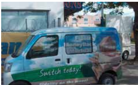
Vehicle wrap using printed vinyl and one way vision vinyl.

In most cases, a company’s vehicle gets an unnoticeable decal or two; the advertising space essentially goes unexploited. In 2005, the SignMan discovered a more modern and explosive version of the car decals they had been applying to vehicles since they first opened. Today, their vehicle wraps boast stunning digitally printed graphics that engulf a company’s vehicle and act like a moving billboard. Studies done in the United States suggest that this