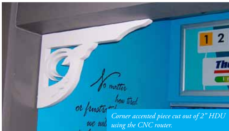
Corner accented piece cut out of 2" HDU using the CNC router.